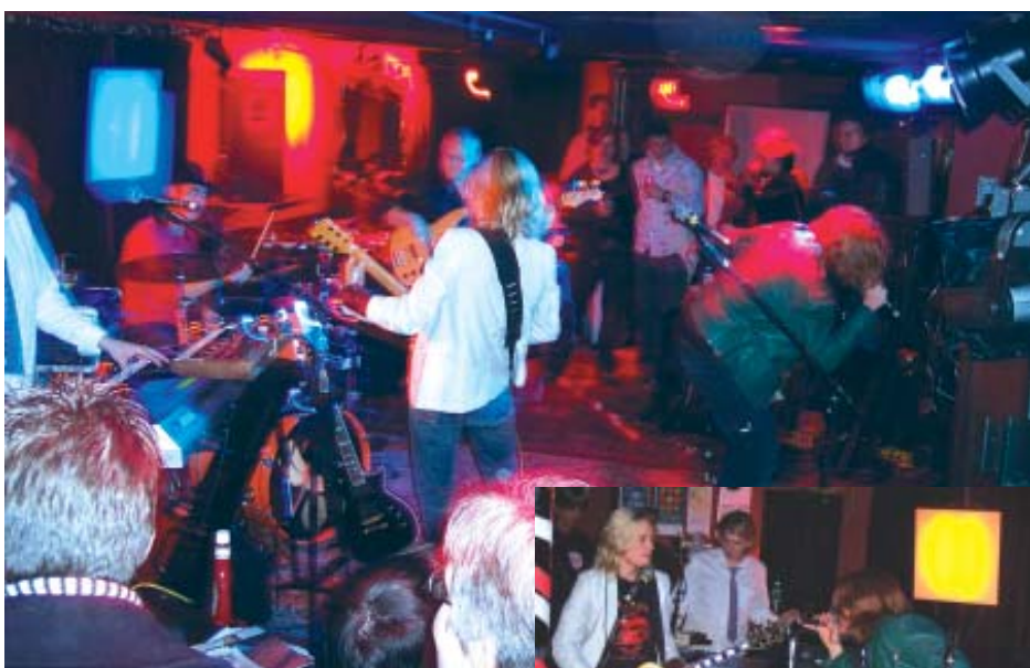
Joining Fluttr Effect at the Lizard Lounge that same night was New York City's The Kin. Besides sharing the night, and a debut CD release, they also shared the distinction of having just undergone a name change as well. Formerly known as The Harlequin, the band celebrated the release of their debut album - "Tracing."