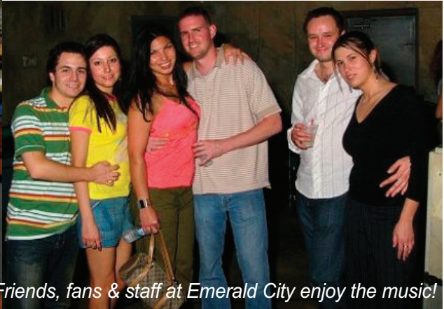
More beautiful people! Friends, fans & staff at Emerald City enjoy the music!