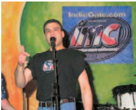
Your not-so-lovely host.