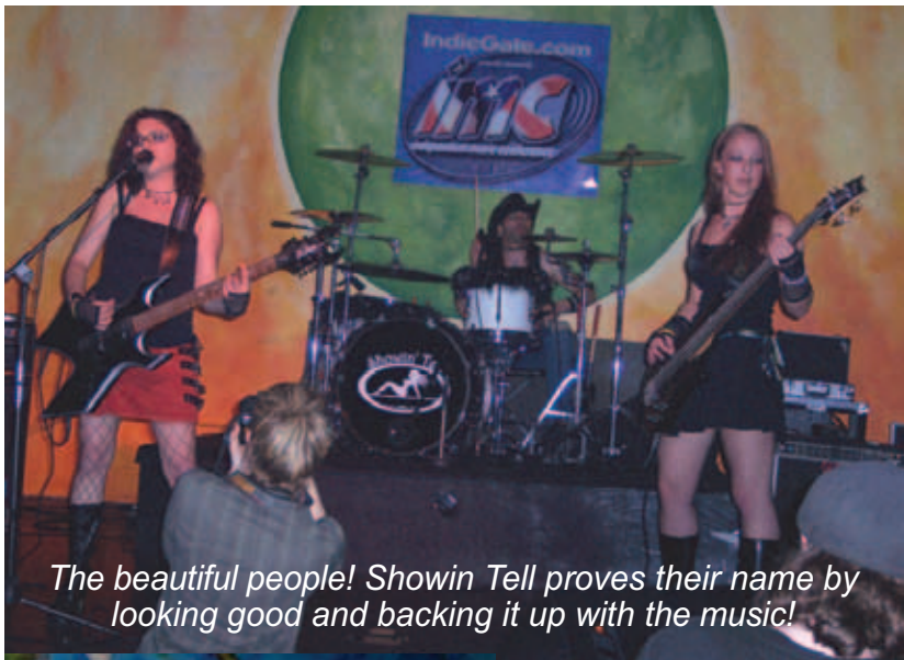
The beautiful people! Showin' Tell proves their name by looking good and backing it up with the music!